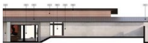
SOUTH ELEVATION 100' 0" x 100' 0"