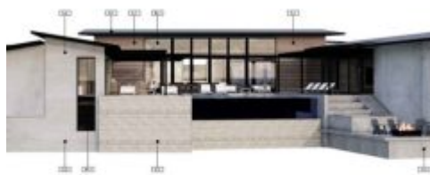
NORTH ELEVATION 100' 0" x 100' 0"